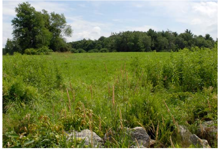
Hayfield at Princeton's Four Corners

The property is a keystone parcel, and its conservation will link a block of thousands of acres of protected land connecting Wachusett Meadow Wildlife Sanctuary, Wachusett Mountain State Reservation, Department of Fish & Game lands, and the state's Department of Conservation and Recreation watershed lands into an expansive greenway through Princeton. In addition to linking these protected lands, conservation of the Four Corners property will preserve agricultural, scenic, and recreational values in Princeton for generations to come.