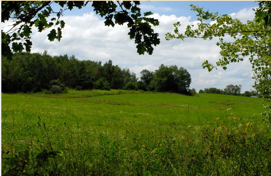
Four Corners hayfield—view to the north

TOWN OF PRINCETON PRINCETON LAND TRUST FOUR CORNERS PRESERVATION SOCIETY MASSAUDUBON THE TRUST FOR PUBLIC LAND