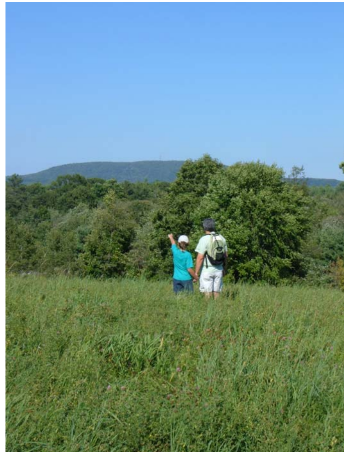
Hikers admire the view of Mt. Wachusett from the Four Corners property

Preserve Rural Princeton Save Four Corners Forever