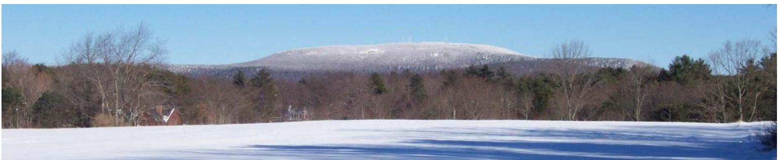
Winter view of Mt. Wachusett

Please use the gift form on the back of this page for your donation to The Trust for Public Land.